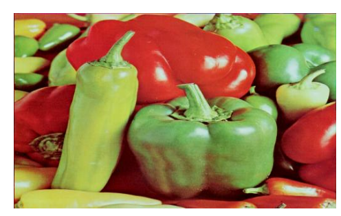
Fig 2: Fruit